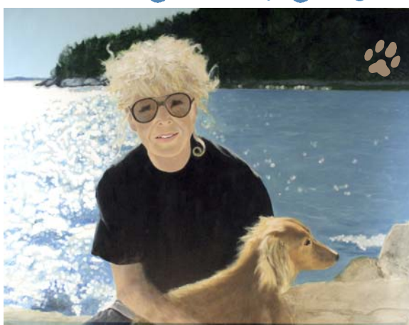
Self Portrait with Holly ■ Oil on cradled panel ■ 16" x 20"